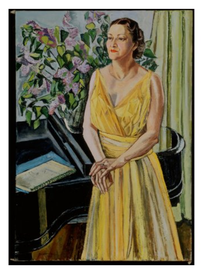
Paraskeva Clark's "Portrait of Frances Adaskin," from the portrait collection at Library and Archives Canada, is on display at the Glenbow in Calgary as part of the show "Ladylikeness."

The original portrait gallery was supposed to exhibit the vast collection of portraits, both paintings and photographs, held by Library and Archives Canada. Since the collapse of the original gallery proposal, Library and Archives has been exhibiting works from its collection in other venues.