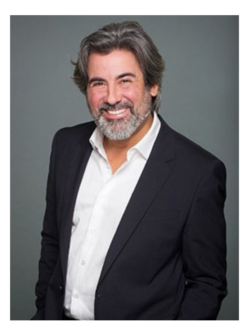
Heritage Minister Pablo Rodriguez

"Since 2016, our government has, however, been proud to make historic investments in cultural infrastructure, including nearly $2 billion in support under the Investing in Canada Plan and the Canada Cultural Spaces Fund," Belanger wrote.