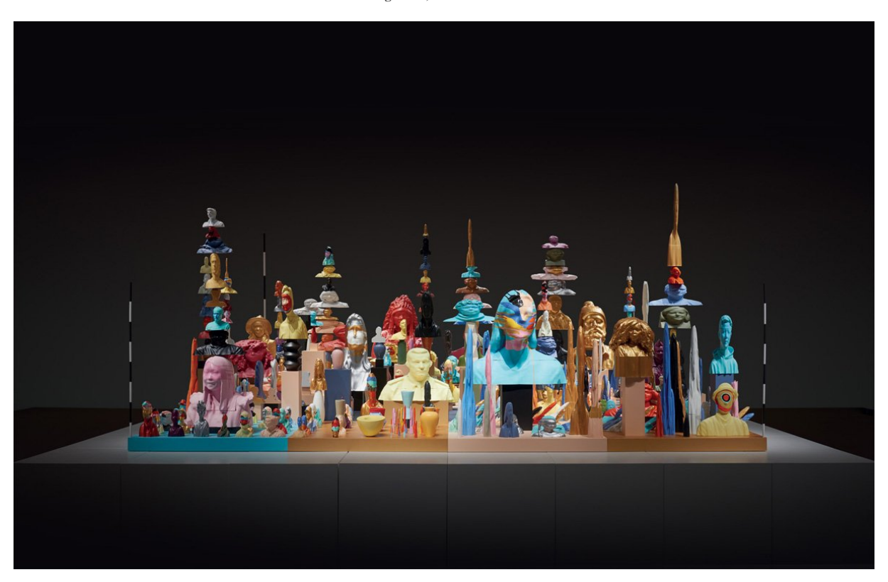
Douglas Coupland's "The National Portrait" appears on publicity material used by a group renewing efforts to create a national portrait gallery.

by Paul Gessell August 24, 2019 12:30 PM